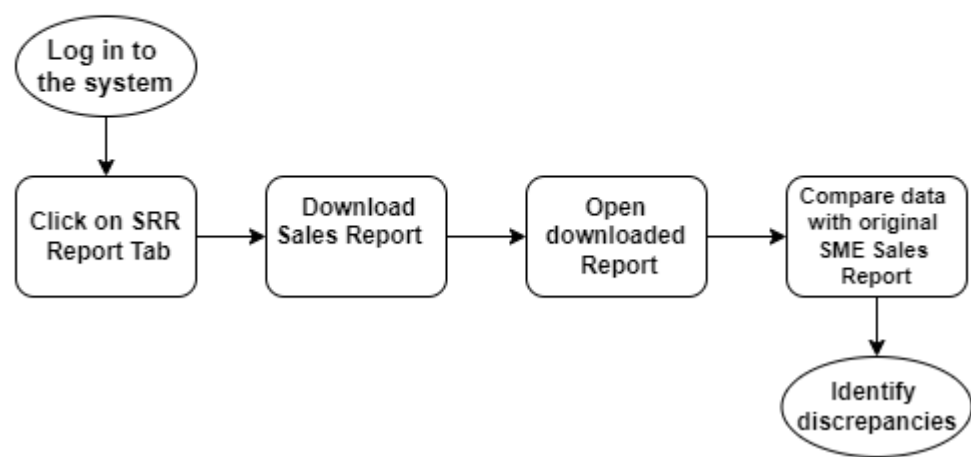
Sales Result Report Diagram